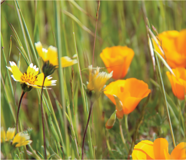
Frances Freyburg Blackburn

Take a moderate three-mile walk to explore the stunning spring wildflowers with docents from Friends of Edgewood. All ages welcome!